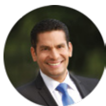
Ismael Cala President Founder

During the first semester of 2016 the Ismael Cala Foundation was in the process of institutional consolidation to strengthen its legal structure including the call for the expansion of its Board of Directors , consisting of: